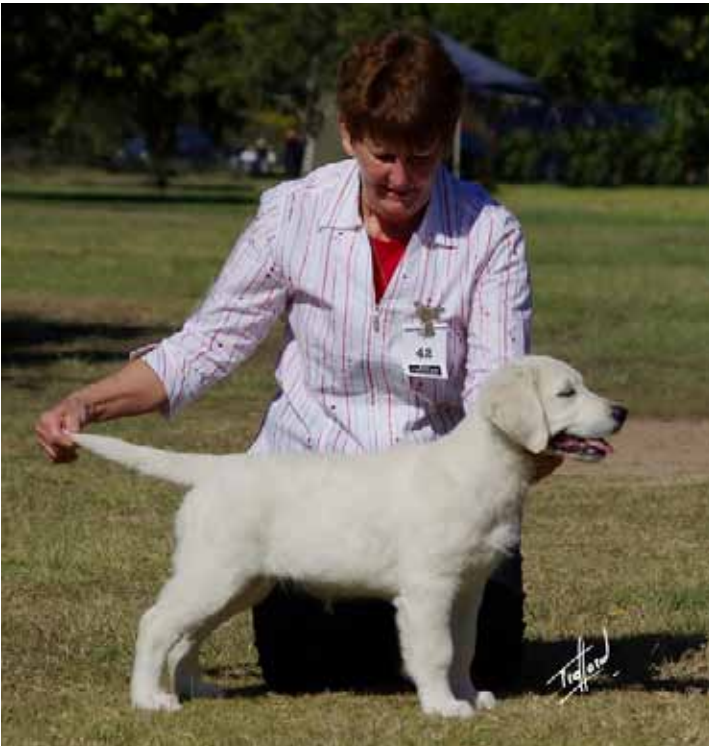
Opposite Baby in Show Kenzanne Living Doll.