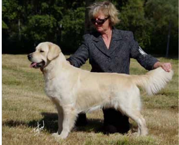
Opposite Junior in Show Ch Giltedge Band of Brothers.