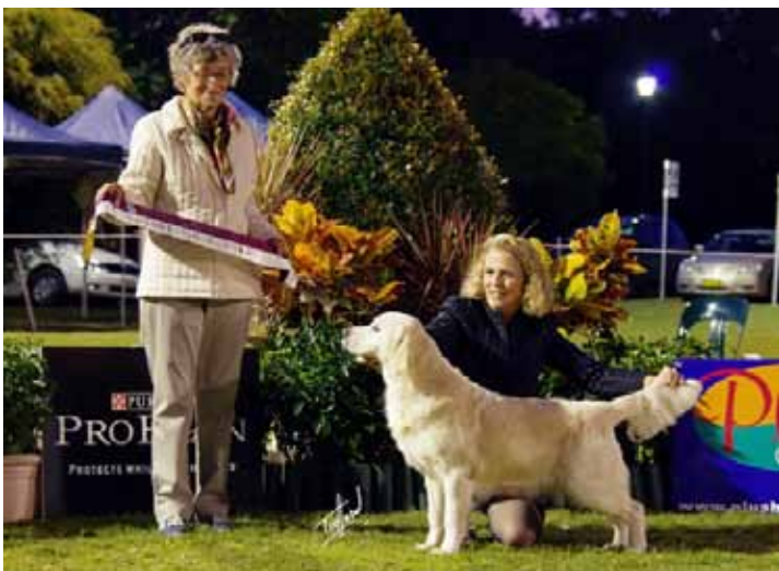
Reserve Challenge Bitch Ch Fantango Just The Ticket.