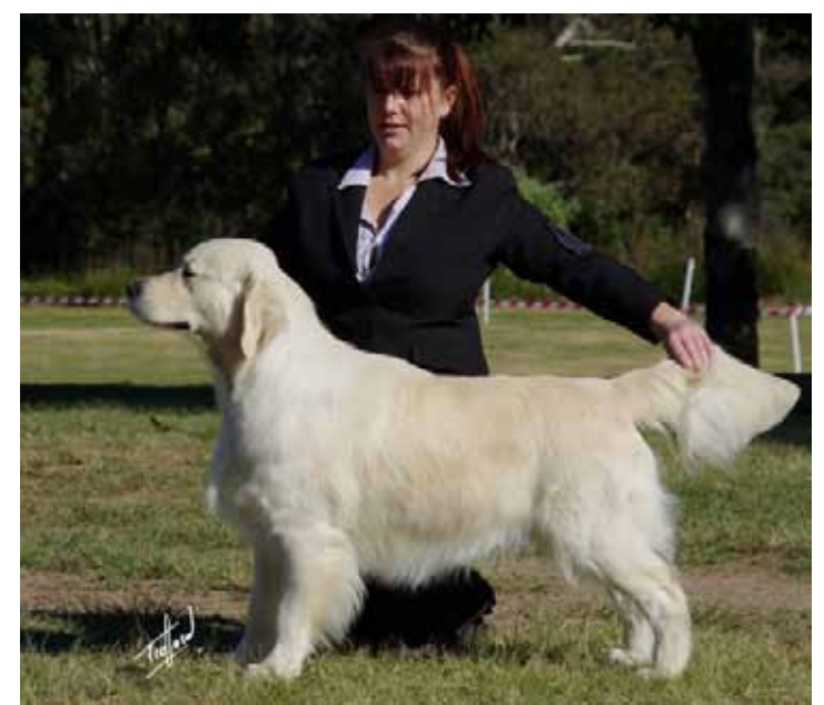
Intermediate in Show Blazengold Imported Jeans.