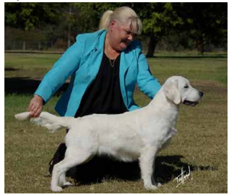
Minor in Show Ashiya No Apologies.