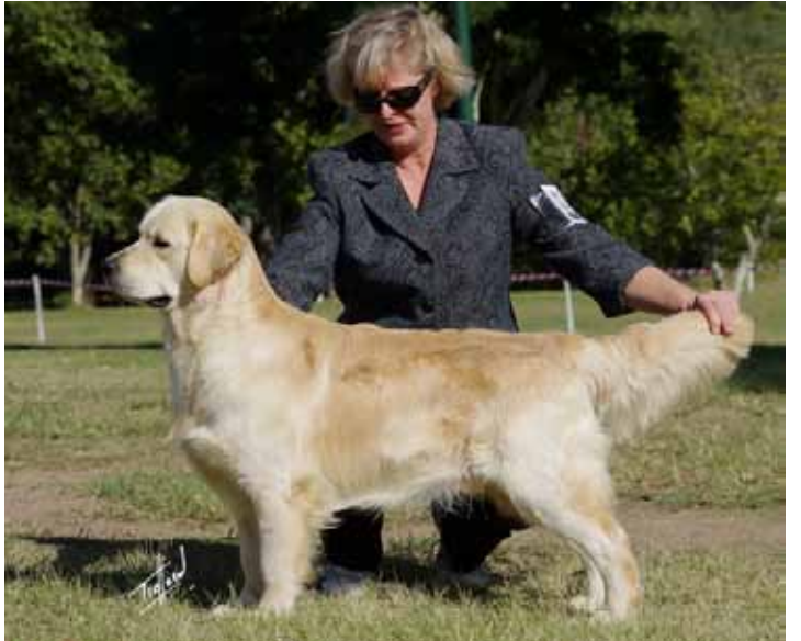
Puppy in Show Giltedge Follow The Leader.