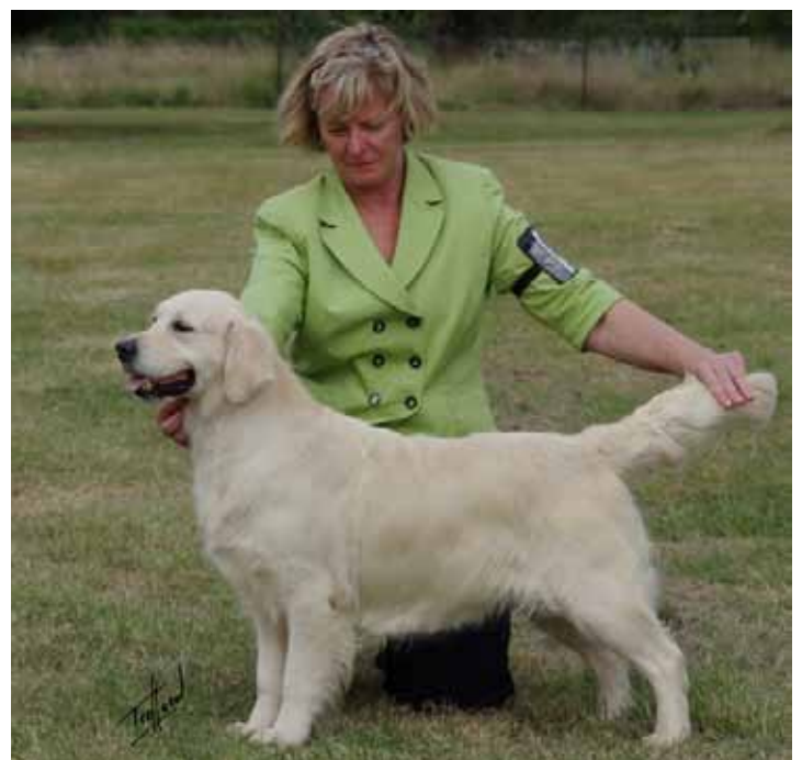
Veteran in Show Ch Giltedge Angel Dust.