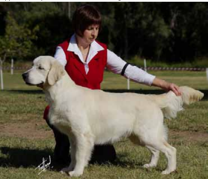
Opposite Minor in Show Naragold Paradiso.