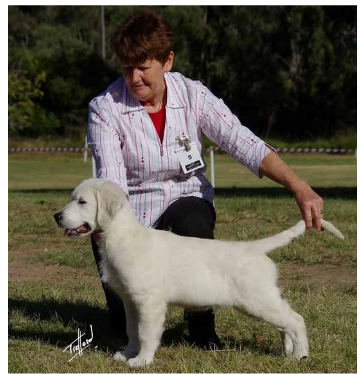
Baby in Show Kenzanne Trade Wins.