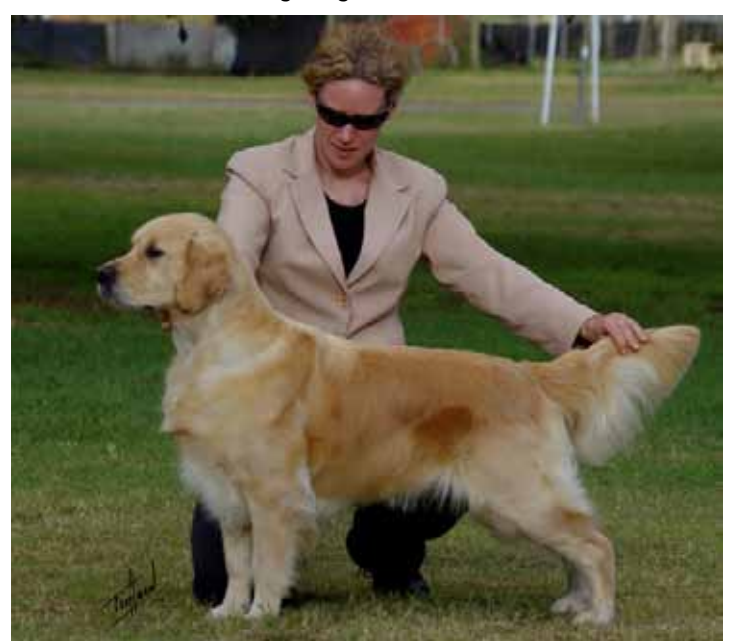
Working Dog Class Gr Ch Yellowfetch Watzit to U (ET).