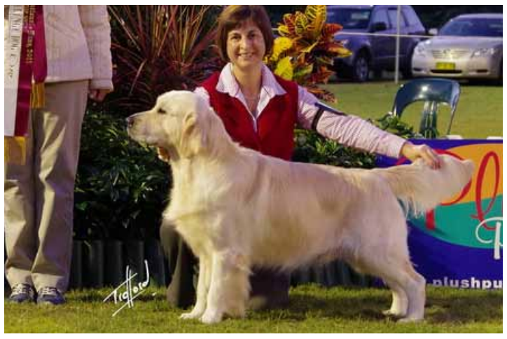
Opposite Open in Show and Reserve Dog Challenge Ch Naragold Magic of Darcy.