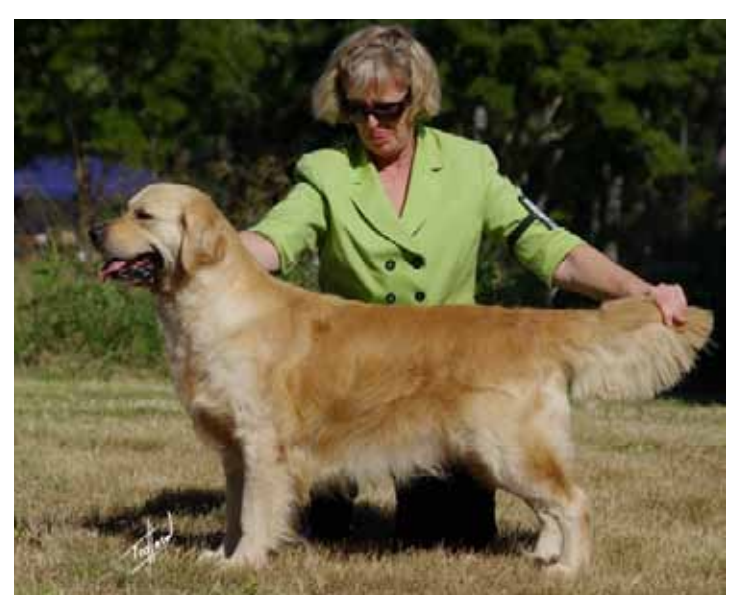
Aust Bred in Show Ch Larbellah Team Leader.

Opposite Intermediate in Show Majik Truly Julie (Imp Fin).