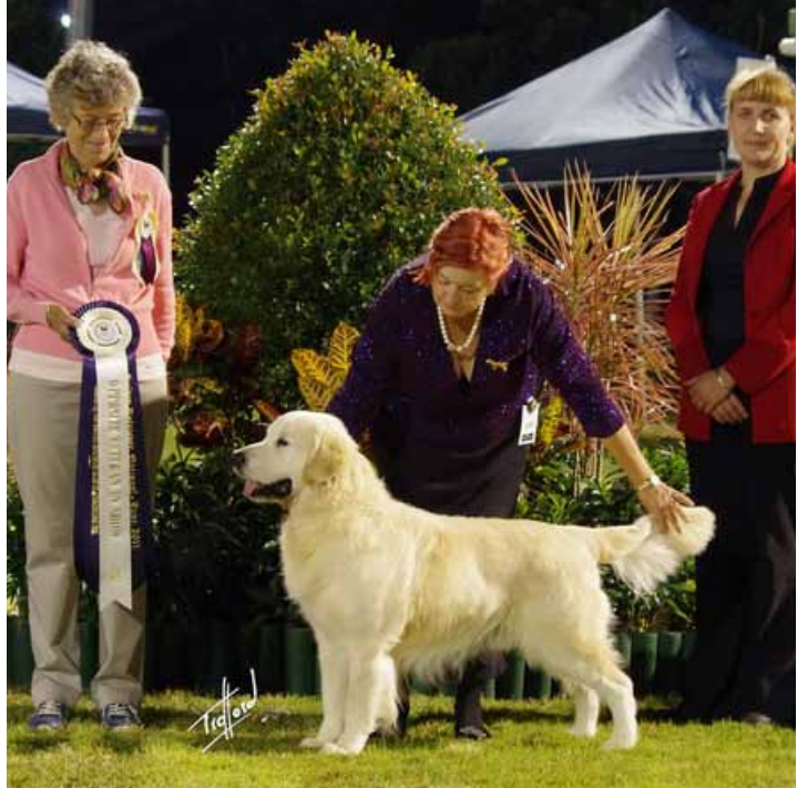
Opposite Veteran in Show Ch NZ Ch Montego Pendragons Quest.