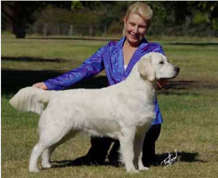
Opposite Puppy in Show Fernfall Give Me Goosebumps.