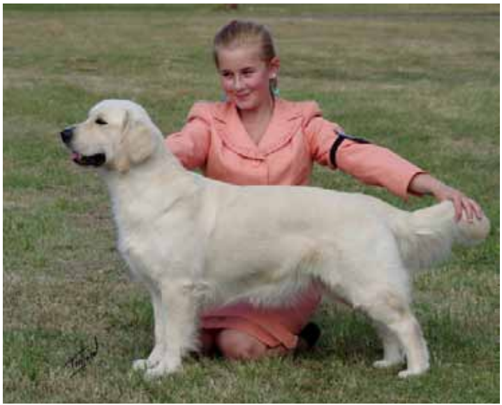
Opposite Aust Bred in Show Ch Dykinta Just a Whisper.